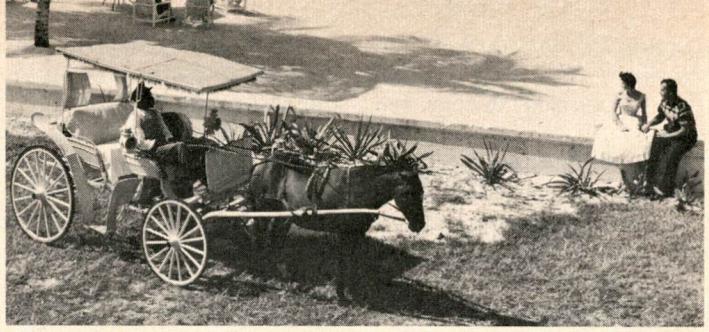
PUT YOURSELF IN THE PICTURE — A surrey with the fringe on top, white sand beaches, and clear, cool water are awaiting Toastmasters and their families in beautiful Nassau, capital of New Providence Island in the Bahamas. Your reservation form for the visit to Nassau is on page 23 of this issue. Fill it out and mail it soon.