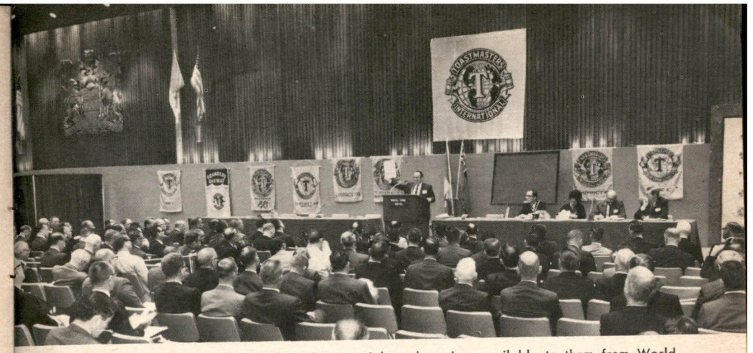
District governors were told about the materials and services available to them from World Headquarters at a panel discussion by the members of the World Headquarters staff.

A bagpiper provided a spectacular entrance for officers, directors, and their wives at the opening of the president's dinner on Friday.