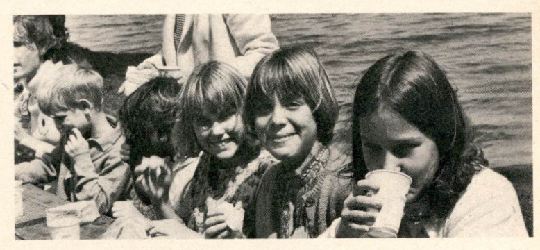
A lunch of sandwiches and soft drinks topped off a wonderful outing for the kids at their picnic on Centre Island.

The beauty of Centre Island and the boats on Lake Ontario were enjoyed by Toastmasters' wives and children during the kids picnic in the park.