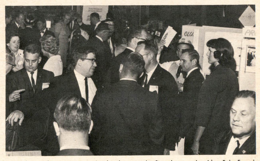
New ideas and programs were in abundance at the Saturday morning Idea Fair. Experienced Toastmasters were on hand at various displays to offer suggestions.