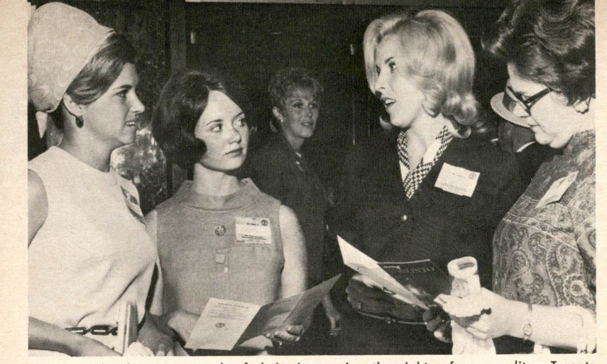
Toastmaster's wives spent much of their time seeing the sights of cosmopolitan Toronto and shopping at the many interesting stores and shops in the city.

Dozens of displays and exhibits had been set up outside the main convention hall by the World Headquarters staff. Included in the displays were samples of new materials available to members and clubs, such as new handbooks on humor and debate; a complete community programs kit; new pamphlets; and counter display racks for introducing the Toastmasters program to business, industry, and new members.