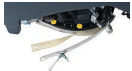
Squeegee wraps around the deck for 100% water pick-up and simply clips onto the bracket with no thumb nuts or adjustment required.