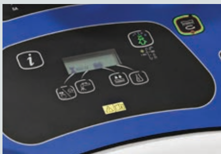
Simple, intuitive controls minimize operator training.

Clean green and still meet the highest expectations for clean floors with the standard onboard EcoFlex System™. The EcoFlex System controls the consumption of detergent so effectively that real savings can be gained without compromising performance. With a single button, effortlessly switch between chemical-free cleaning or select from weak to strong cleaning intensities to match cleaning performance to the soil on the floor and the required level of clean. More soil? No problem. Activate the "burst of power" for extra cleaning performance and easily return to the original settings for minimum usage of water, detergent and power.