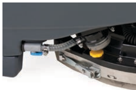
Externally mounted solution filter allows operators to easily clean the filter and manage the solution level.