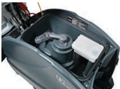
Flip-up lid and tilt-back tank provides easy access to the recovery tank, debris catch cage, batteries and EcoFlex™ cartridge.

Schools and Universities Entertainment Arenas Hospitals and Healthcare Facilities Grocery Stores Office Buildings Retail Outlets Sports Centers