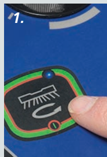
1. Scrubbing parameters are easily controlled with a single button.