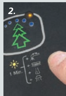
2. EcoFlex™ System Burst of Power button easily increases cleaning performance.