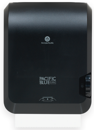
Mechanical Towel Dispenser