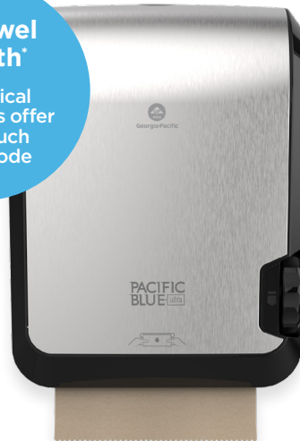
Recessed Mechanical Towel Dispenser

Mechanical Dispensers offer a no-touch hang mode