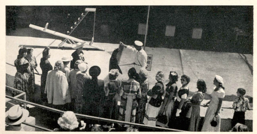
San Diego Zoo

Memories of the efforts of the San Diego Toastmasters to entertain their visitors will linger long with those who enjoyed the hospitality.