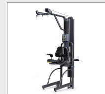
E875MU: Body unweighting system