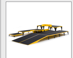
E875MP: Wheelchair ramp, stairs and clinician platform