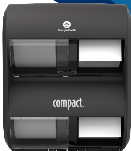
Redesigned Dispenser - 56744B

Compact Quad® Plus 4-Roll Toilet Paper Dispenser