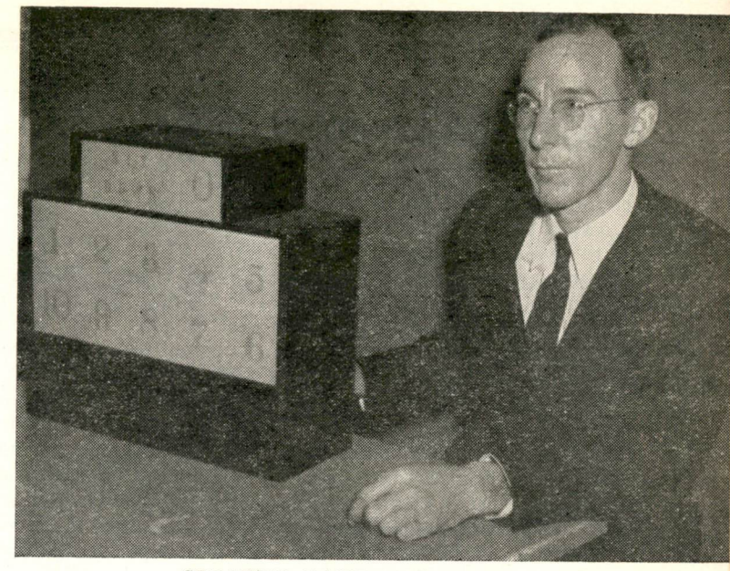
SPEAKER, TAKE WARNING!