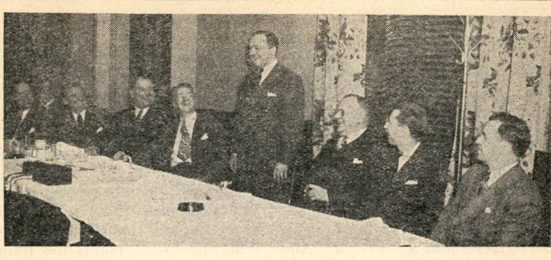
IN THE WINDY CITY

Hospitality House Toastmasters Club No. 379 uses the regular "diagonal" chart plan for making program assignments, but does not stop with that. Attached to this sheet is another, indicating the program for each date, and giving directions for arranging the meeting. March programs as outlined include a panel discussion, a debate, parliamentary practice, a contest, and a ladies' night.