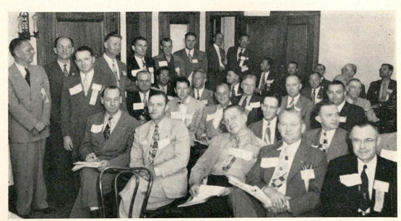
The Training Sessions for District Officers were a good example of effective use of "Conference Technique." Here are some of the leaders in the districts for the coming year.

This technique has saved hours of time for me and for other busy people. It will do the same for you if you will use it.