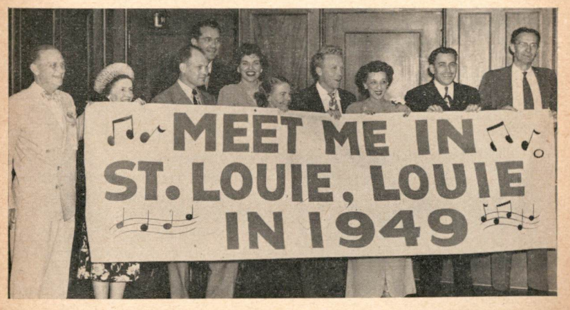
The invitation brought by the St. Louis delegation proved effective. While various other cities offered their hospitality, the voices from St. Louis were urgent, insistent, compelling. And so the 1949 convention will go to that great "air-conditioned" city on the Mississippi.

And let me remind you that ours is an international organizationwith one District and many Clubs in Scotland, another District completely in Canada, and still more Canadian Clubs joining with United States Clubs to form another District. Only the matter of language can prevent the rapid world-wide growth of Toastmasters International. For the Bonanza which we seek is not buried in some hard-to-reach spot in northern California, but is found whereever men will recognize the matchless worth of effective speaking, and will dig, dig, dig-employing the proper maps and tools!