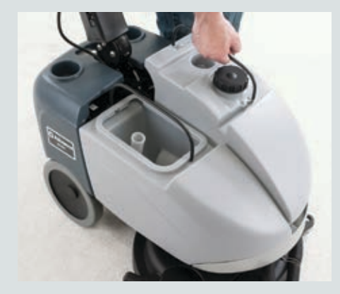
Easily remove the recovery and solution tanks to fill, drain and clean them away from the machine.