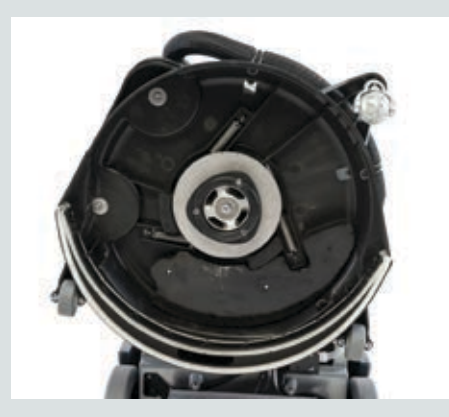
The SC351™ squeegee system provides increased vacuum performance for better water pick-up. The tools-free squeegee can be easily and comfortably removed for cleaning.

The SC351's easily accessible, removable 3 gallon recovery tank and a 2.5 gallon solution tank ensure minimal equipment maintenance. Don't mess with timely tank cleaning, instead, remove the tanks to quickly fill, drain and clean them away from the machine itself. Further, all machine components are accessible without the need for tools—including the squeegee.