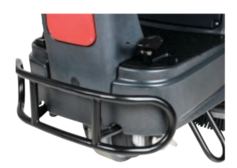
Standard front bumper protects the machine