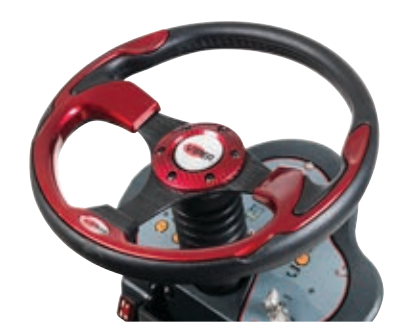
Intuitive dashboard, with single touch buttons for simplicity and ease of use