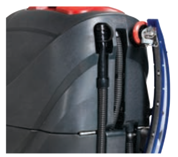
Built in squeegee hanging system for ease of transport in narrow areas