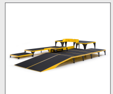
E872MP: Wheelchair ramp, stairs and clinician platform