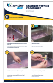
KleenLine™ Pro Sanitizer Testing Procedure Wall Chart SASCD6