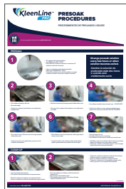
KleenLine™ Pro Pre-Soak Procedures Wall Chart SASCD2