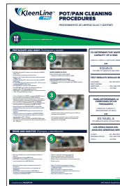
KleenLine™ Pro Pot & Pan Cleaning Procedure Wall Chart SASCD7