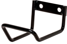
F Style Wall Mount Hook Product holder for Max-3X closed loop bottles. TCD-70-0903, 1/cs