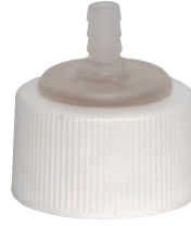
Mating Cap (Straight) Mating cap for use with Max-3X closed loop bottles with straight line adapter. SASCD001, 1/cs