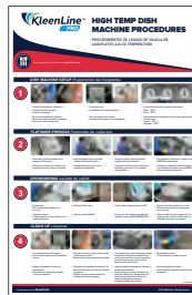
KleenLine™ Pro High Temp Procedures (Front) Low Temp Procedures (Back) SASCD3