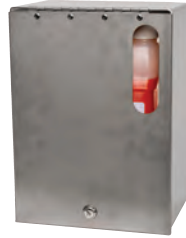
Stainless Steel Box Security box for Max-3X closed loop bottles. CC-100, 1/cs