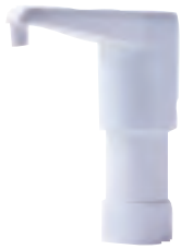
Max-3X Hand Pump 1 oz. Pump, Use with Manual Pot & Pan Detergent, Liquid Pre-Soak and Floor Cleaner. 92668-10, 1/cs 1/4 oz. Pump, Use with Quat Sanitizer 92669-10, 1/cs