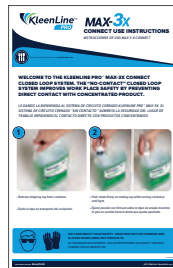
KleenLine™ Pro Sure Connect Cap Procedures Wall Chart SASCD5