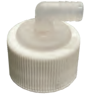
Mating Cap (90 Degree Angle) Mating cap for use with Max-3X closed loop bottles with 90 degree adapter for tight areas. 9265810, 1/cs