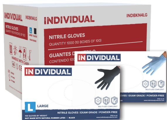
Case Pack: 1000 Gloves (10 Boxes of 100 Gloves)

Exam grade Nitrile gloves provide the strength of synthetics and the flexibility of latex. They are powder and latex free and multi-use compliant* including medical and food service applications.