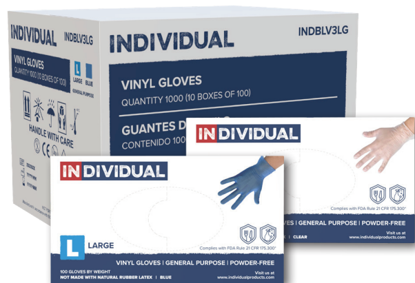
Case Pack: 1000 Gloves (10 Boxes of 100 Gloves)

Vinyl gloves offer cost effective protection for short term tasks. They are a popular choice for food preparation, light cleaning, painting, and more. Powder and latex free.