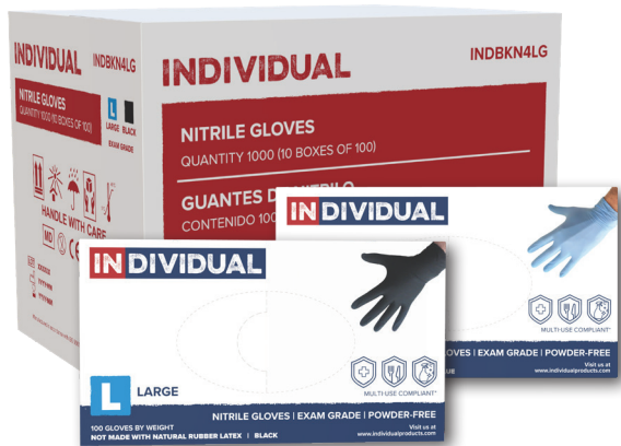
Case Pack: 1000 Gloves (10 Boxes of 100 Gloves)

Exam grade Nitrile gloves provide the strength of synthetics and the flexibility of latex. They are powder and latex free and multi-use compliant* including medical and food service applications.