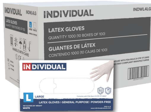
Case Pack: 1000 Gloves (10 Boxes of 100 Gloves)