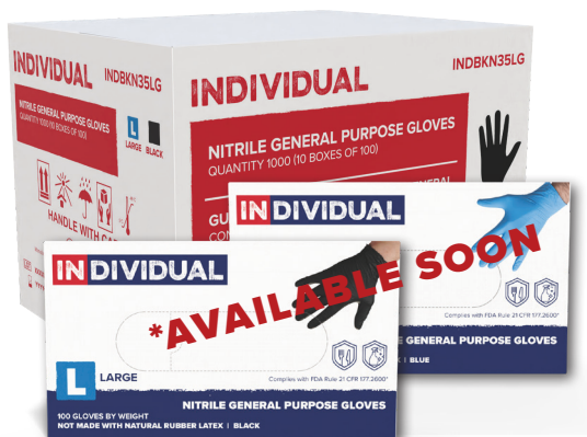
Case Pack: 1000 Gloves (10 Boxes of 100 Gloves)

Designed for safe food handling, these general-purpose gloves help maintain a clean and healthy food service environment. They are also a great choice for cleaning and janitorial tasks. They are powder- and latex-free.