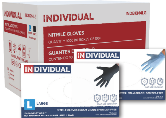
Case Pack: 1000 Gloves (10 Boxes of 100 Gloves)

Exam grade Nitrile gloves provide the strength of synthetics and the flexibility of latex. They are powder and latex free and multi-use compliant* including medical and food service applications.