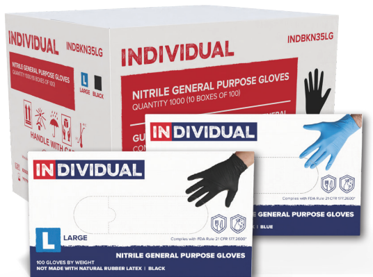
Case Pack: 1000 Gloves (10 Boxes of 100 Gloves)

Nitrile General-Purpose Gloves are an excellent choice for light to medium duty tasks in foodservice, cleaning, and other industries. They are powder-free and not made with natural rubber latex.