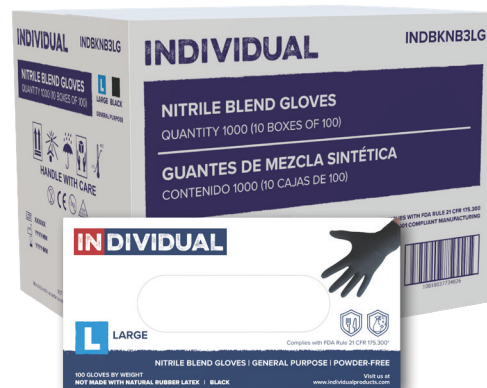
Case Pack: 1000 Gloves (10 Boxes of 100 Gloves)