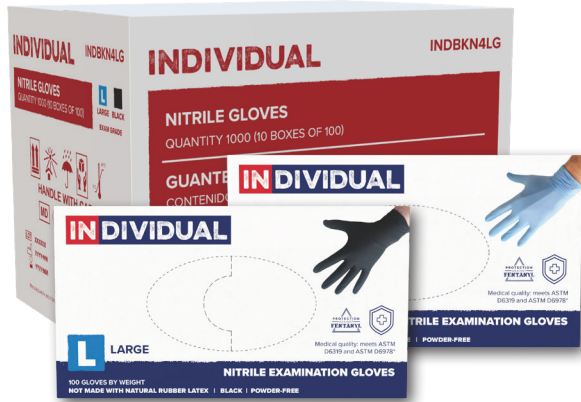
Case Pack: 1000 Gloves (10 Boxes of 100 Gloves)

Exam grade Nitrile gloves provide the strength of synthetics and the flexibility of latex. They are powder-free and not made with natural rubber latex and multi-use compliant including medical and food service applications.