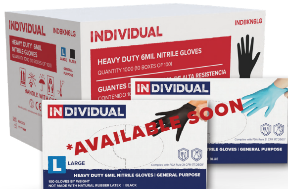
Case Pack: 1000 Gloves (10 Boxes of 100 Gloves)

Heavy Duty 6mil Nitrile gloves offer exceptional durability and puncture resistance making them an ideal choice for professionals who require both safety and dexterity. They are powder and latex free.