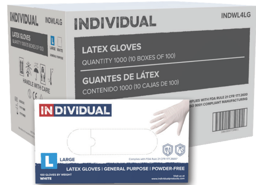
Case Pack: 1000 Gloves (10 Boxes of 100 Gloves)