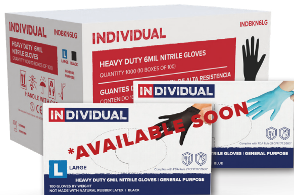
Case Pack: 1000 Gloves (10 Boxes of 100 Gloves)

Heavy Duty 6mil Nitrile gloves offer exceptional durability and puncture resistance making them an ideal choice for professionals who require both safety and dexterity. They are general purpose grade, powder- and latex-free.