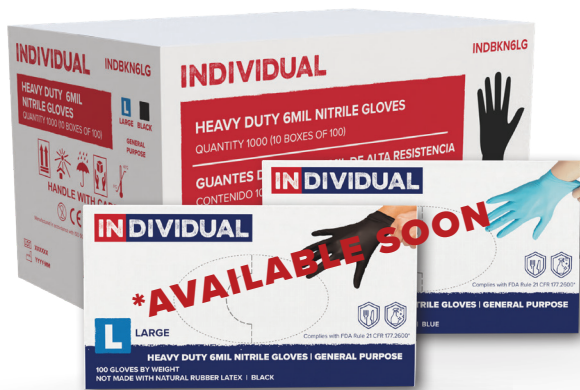
Case Pack: 1000 Gloves (10 Boxes of 100 Gloves)

Heavy Duty 6mil Nitrile gloves offer exceptional durability and puncture resistance making them an ideal choice for professionals who require both safety and dexterity. They are general purpose grade, powder- and latex-free.