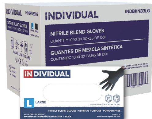
Case Pack: 1000 Gloves (10 Boxes of 100 Gloves) • Thickness and weights are available on the product specification sheets