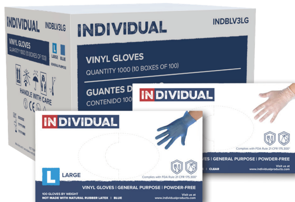
Case Pack: 1000 Gloves (10 Boxes of 100 Gloves)

Vinyl gloves offer cost effective protection for short term tasks. They are a popular choice for food preparation, light cleaning, painting, and more. Powder and latex free.