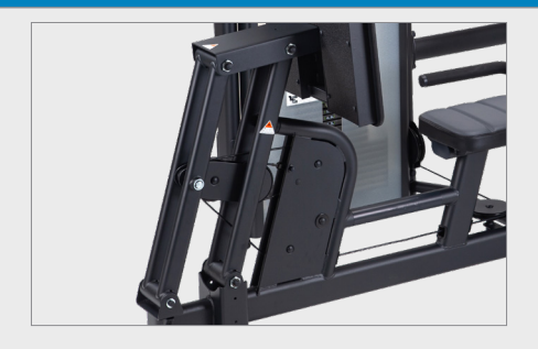
Unique 4-bar linkage system keeps the foot plate at a consistent angle for optimal lower body alignment and proper biomechanics