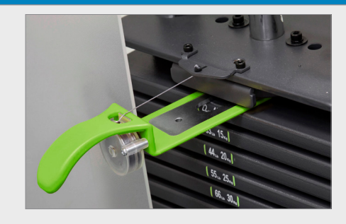
Stacks feature sound dampeners and magnetized selector fork for maximum stability