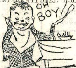
"The Speaker !!!"

Not only is the Toastmaster idea a boom to married men but it helps the single men become fluent so that they soon enter the married class.