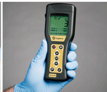
3. Upload to CompuClean®