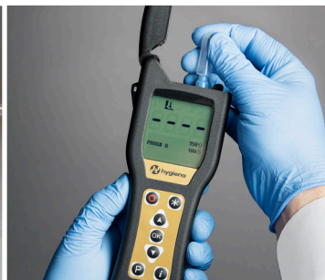
2. Snap swab & insert into ATP Meter