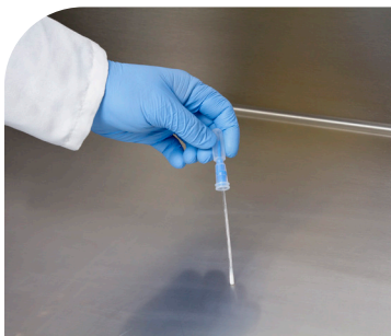
1. Swab surface