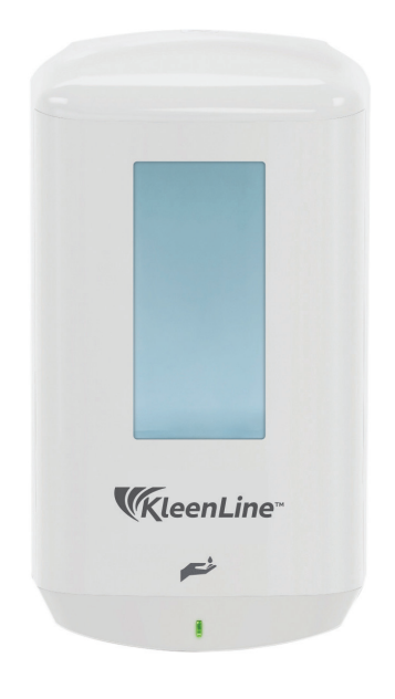
KleenLine™ No-Touch Foam Handwash Dispenser

Durable and reliable push-style systems. Easy to maintain.