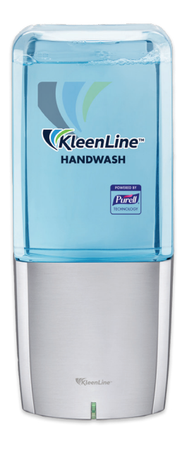
KleenLine™ NRG10™ No-Touch Foam Handwash Dispenser

Touch-free systems built for reliable performance and ease-of-maintenance.