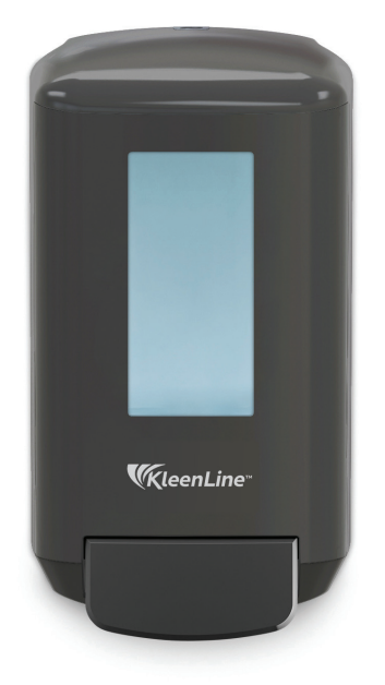
KleenLine™ Manual Foam Handwash Dispenser

Three different systems that are built for reliability and high performance.