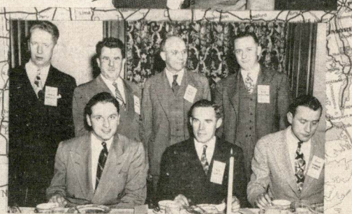
AT ROCHESTER - Western New York was well represented in the meeting at Rochester, where Buffalo "Pioneer" Toastmasters received Charter No. 506. The picture shows a group of the visiting Toastmasters at Rochester