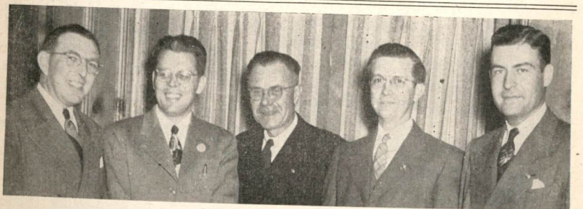
COMPLETE THE DIAMOND