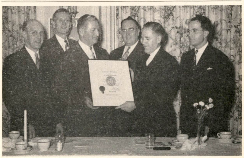
THEY SAID: "SHOW ME!"

"Ability to hold a conference and conduct it correctly is an asset to anyone. We of Servel Toastmasters believe that training obtained in our Club is the best way to learn to conduct a conference. We shall deal more with conference procedure in the future."