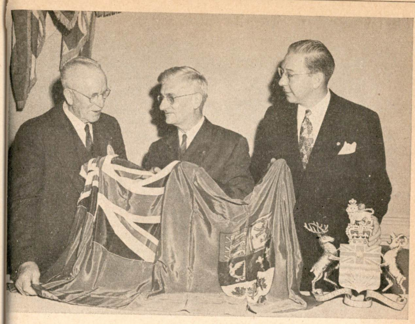
ACROSS THE BORDER

Santa Monica Toastmasters Club, No. 21, (perpetual contender for Club-of-the-Year honors) had prepared for distribution an excellent "check list" for the speaker and toastmaster. Copies of this will be available through the Home Office.